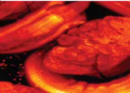
Feeding adult nematode on the surface of the intestine captured by prototype 2-photon laser scanning confocal microscope (Eversole, R., Zipfel, W. and Webb, W.)

ing in four dimensions (x, y, z and t). Digital capture can be accomplished in video, (Javelin RGB: color, Hamamatsu BW) or digital cooled CCD (Hamamatsu C4742-95). The digital camera has high resolution and low light (sub-visual) capability. These devices are coupled to a Datastor pentium III processor through a Mutech Imaging board. Digital acquisition and processing is done utilizing Metamorph software from Universal Imaging Corporation.